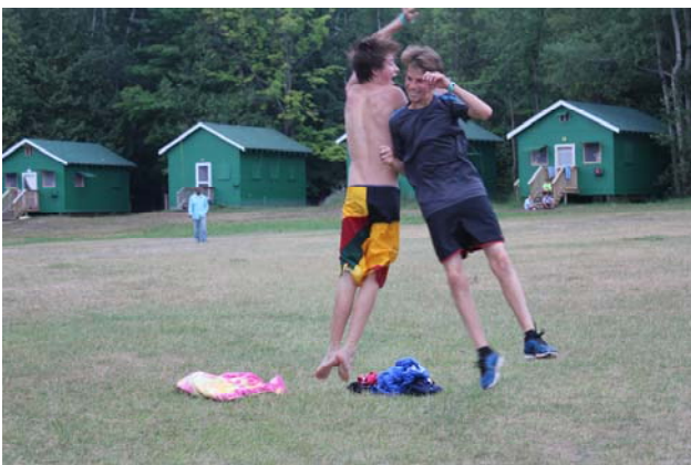
Third session biathletes celebrate completing the 1-mile swim and 2-mile run