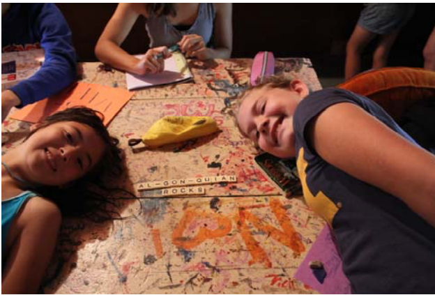
"Bananagrams" was a very popular choice among campers and staff this summer!!