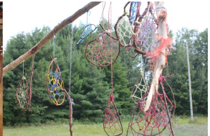
LEFT: With the help of Assistant Kitchen Director Molly Belhaj, FUNK campers made banana bread to serve all of camp breakfast! The blackberries decorating the bread were picked on camp. RIGHT: Part of the dreamcatcher garden that surrounds the FUNK house. If you want to see the interior, you'll have to visit yourself!