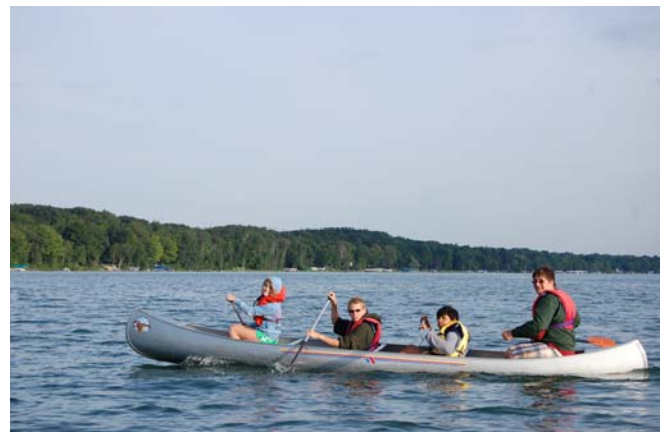
This group of campers successfully canoed across the lake and back!