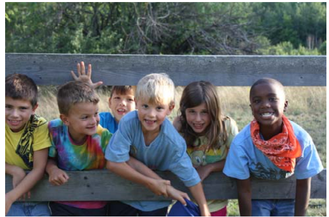
Mini-Camp for campers ages 6-10 ran for a ½ week during sixth session, and was great fun!