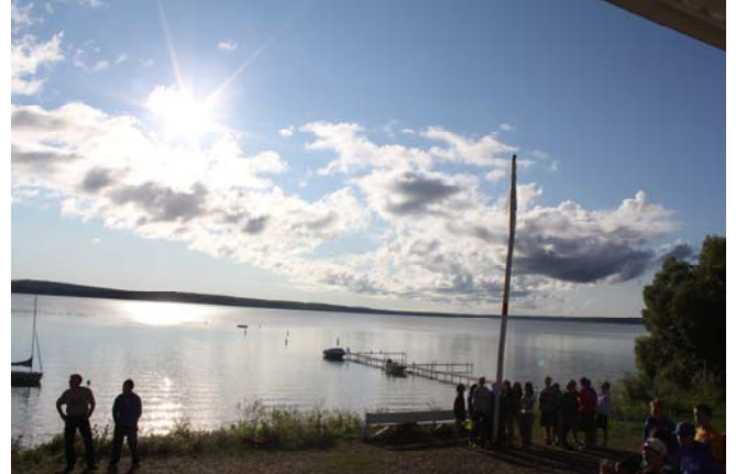
The scenery at camp was beautiful, as per usual!!